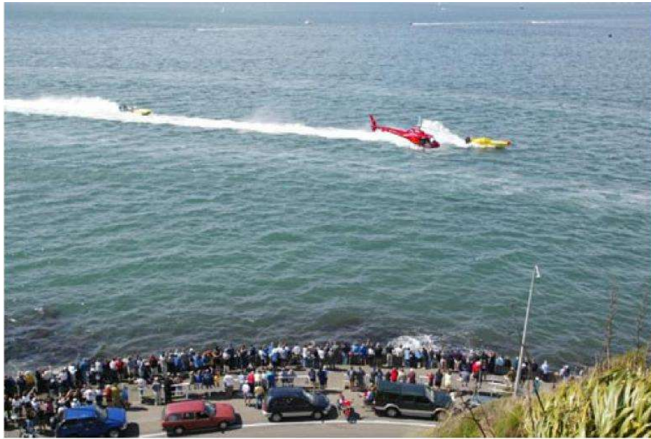
The Crowds Line up at Point Jerningham to grab a glimpse of the action